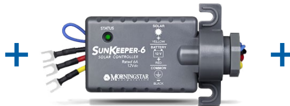
Morningstar SunKeeper 6A or 12A Charge Controller