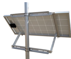
Side-of-Pole Mount (optional)