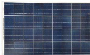
20W to 150W module