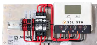
Control Panel: 230179