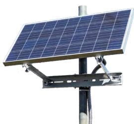
Side of Pole Mount: 240044