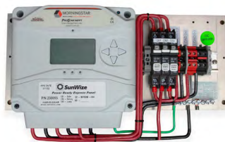
Control Panel: 230055