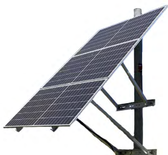
Side of Pole Mount: 240060