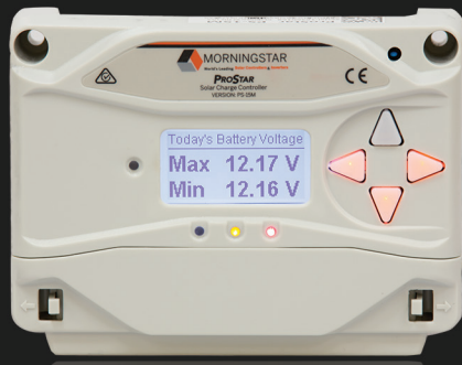
ProStar (Gen 3) Shown with optional meter