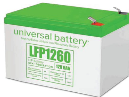
Due to continuous improvements to our products, product may vary slightly from depiction.