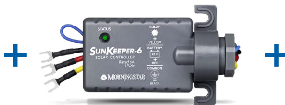
Morningstar SunKeeper 6A or 12A Charge Controller