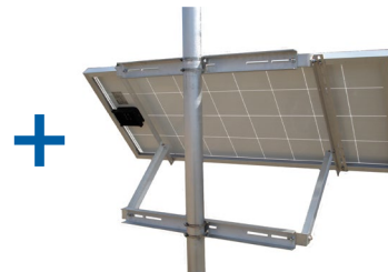
Side-of-Pole Mount (optional)