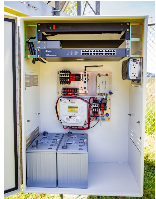
M2-8D enclosure with Rack-mount and control panels