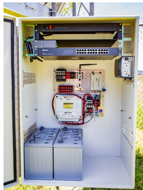
M2-8D enclosure with Rack-mount and control panels