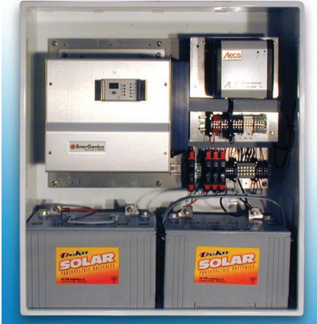
WF2 Enclosure with two G31 batteries

The SunWize Power & Battery WF2 aluminum enclosure features a white powder-coated finish and a NEMA3R rating for indoor or outdoor use. The WF2 enclosure can mount on a flat vertical surface or on a variety of pole sizes. It also features hinged, key-lockable doors with dust covers on locks and gasketed door. Passive cooling ventilation. Four bottom 1/2" electrical knockouts.