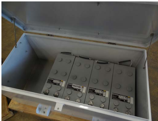
T-4X8D Enclosure with four 4D batteries

The SunWize Power & Battery T-4X8D aluminum enclosure features a white powder-coated finish and a NEMA3R rating for indoor or outdoor use. The T-4X8D enclosure can mount on any flat surface. It also features a hinged, pad-lockable door and passive cooling ventilation. Two left side 1/2" electrical knockouts.