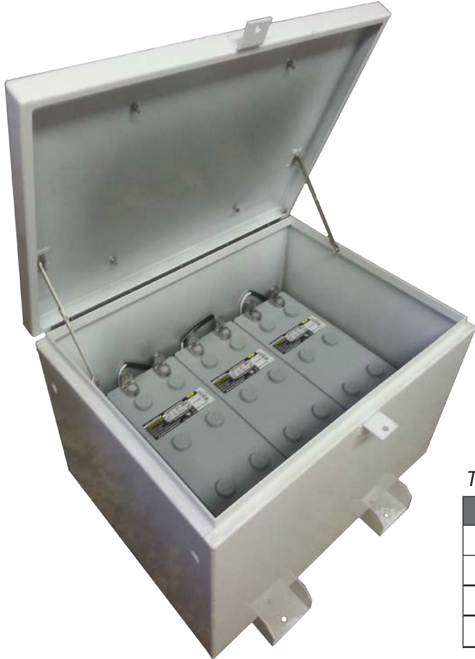
T-2X8D Enclosure with three 4D batteries

The SunWize Power & Battery T-2X8D aluminum enclosure features a white powder-coated finish and a NEMA3R rating for indoor or outdoor use. The T-2X8D enclosure can mount on any flat surface. It also features a hinged, pad-lockable door and passive cooling ventilation. Two left side 1/2" electrical knockouts.