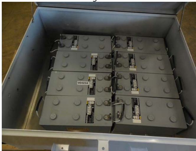
T-8X8D Enclosure with eight 8D batteries

The SunWize Power & Battery T-8X8D aluminum enclosure features a white powder-coated finish and a NEMA3R rating for indoor or outdoor use. The T-8X8D enclosure can mount on any flat surface. It also features a hinged, pad-lockable door and passive cooling ventilation. Two left side 1/2" electrical knockouts.