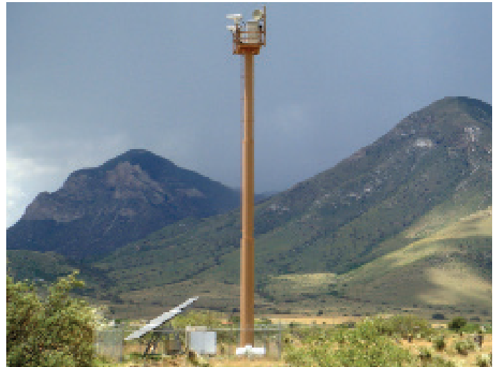
SunWize 1800W Power Station