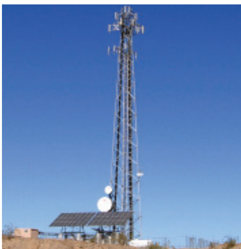
SWPB PSG7680 Hybrid Power Station

SunWize® Power & Battery Power Stations are complete, integrated solar power systems designed for site loads requiring 12/24/48VDC or 110V-240V, 50Hz/60Hz AC voltage. Wired to NEC standards, each SWPB Power Station provides safe and reliable power without the expense of installing utility power. The solar array tilt is easily adjustable to maximize solar energy output. The systems are mounted on galvanized steel structures or trailers engineered to withstand harsh environments and high wind loads.