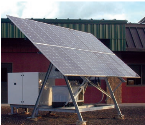
SWPB 1920W Power Station

For continuous loads of 75 to 8,000 watts