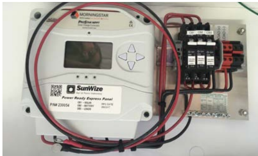
Control Panel Example. PS-MPPT 25A Controller with Meter

The SunWize Power Ready Express (PRE) product control panels use quality components and are built using superior craftsmanship and attention to detail. We have developed a wide range of systems to cover most of the standard applications for remote power systems from 10 to 1200 Watts of solar array. Converter, inverter, and other accessory side panels are available to allow the Power Ready Express systems to serve a wide range of applications.