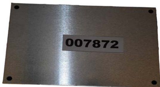
2/4 Battery Sideplate