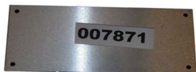
1 Battery Sideplate