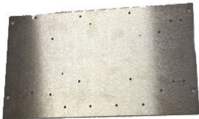
004135 BC 45-60