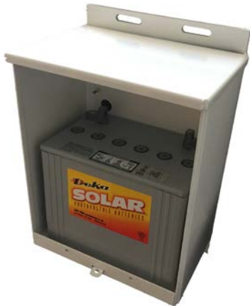
M1-24 Enclosure fits a single G24 battery

The SunWize Power & Battery M1-24 aluminum enclosure features a white powder-coated finish and a NEMA3R rating for indoor or outdoor use. The M1-24 enclosure can mount on a flat vertical surface or on a variety of pole sizes. It also features pad-lockable lift off doors and passive cooling ventilation.