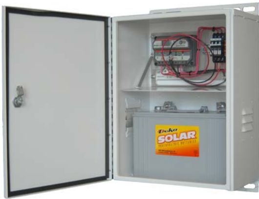
M1-31 Enclosure fits a single G31 battery

The SunWize Power & Battery M1-31 aluminum enclosure features a white powder-coated finish and a NEMA3R rating for indoor or outdoor use. The M1-31 enclosure can mount on a flat vertical surface or on a variety of pole sizes. It also features a padlockable wing latch for added security.