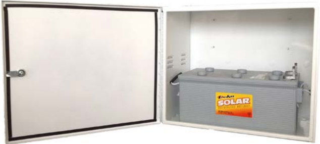
M1-8D Enclosure with a single 8D battery

The SunWize Power & Battery M1-8D aluminum enclosure features a white powder-coated finish and a NEMA3R rating for indoor or outdoor use. The M1-8D enclosure can mount on a flat vertical surface or on a variety of pole sizes. It also features a padlockable wing latch for added security.