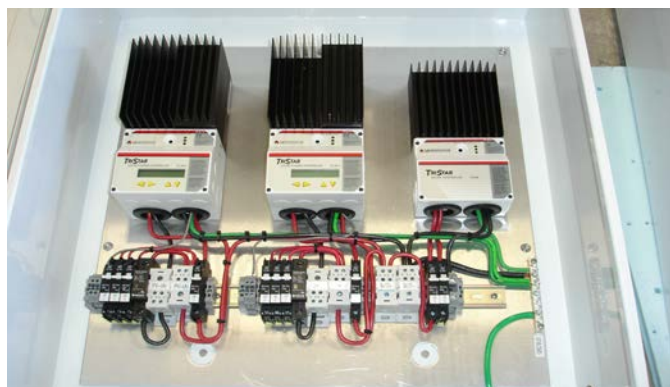
Mounted Backplate Example 1