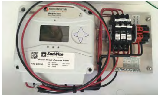
Control Panel Example. PS-MPPT 25A Controller with Meter

The SunWize Power Ready Express (PRE) product control panels use quality components and are built using superior craftsmanship and attention to detail. We have developed a wide range of systems to cover most of the standard applications for remote power systems from 10 to 1200 Watts of solar array. Converter, inverter, and other accessory side panels are available to allow the Power Ready Express systems to serve a wide range of applications.