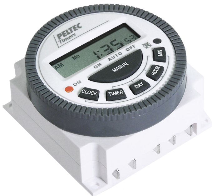
12 volt Timer

The timer accessory side plate features a Peltec fully programmable, 24-hour, 7-day, digital timer. The timer has a digital display that displays the current status of the timer and allows easy adjustment of the timer's programming.