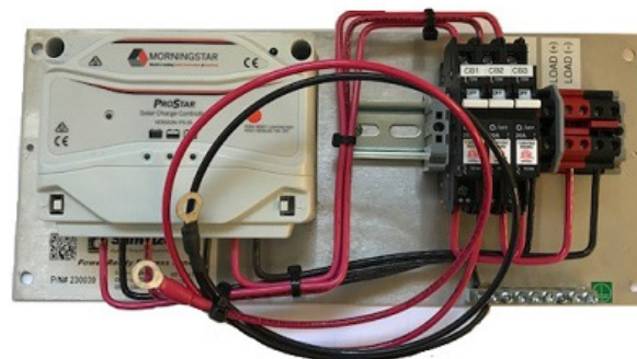
PRE Control Panel with a 30 amp ProStar

The control panel consists of a backplate; a charge controller; two load terminals; and breakers for the array, battery and load. All breakers are sized to match the rating of the charge controller.