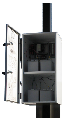
Pole Mounted, SWPB Power Online System

SunWize® Power & Battery Power Online Systems provide continuous DC power with battery backup from an AC source. These fully integrated, weatherproof units convert AC primary power to charge a 12 or 24 VDC sealed battery bank while powering a DC load or an AC load with integral inverter option.