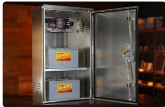
TRANSPORTATION AND SAFETY