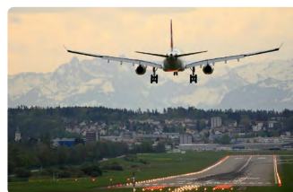
AIRPORT NOISE MONITORING