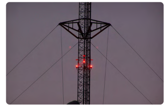
FAA RADIO TOWER LIGHTING