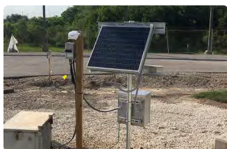
REMOTE IOT SOLUTIONS