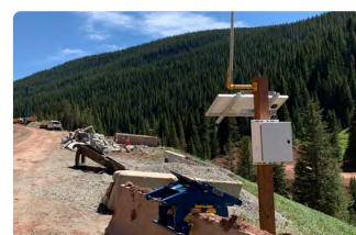
ROADSIDE DATA COLLECTION