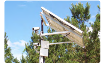
SECURITY AND SURVEILLANCE