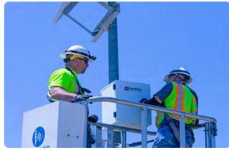
LIGHTING AND SIGNAGE