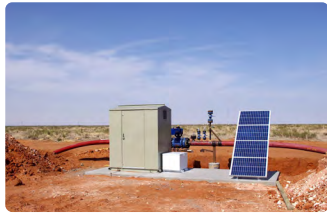
AUTOMATION AND CONTROL