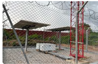
DEFENSE AND MILITARY