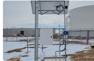
WATER AND WASTEWATER