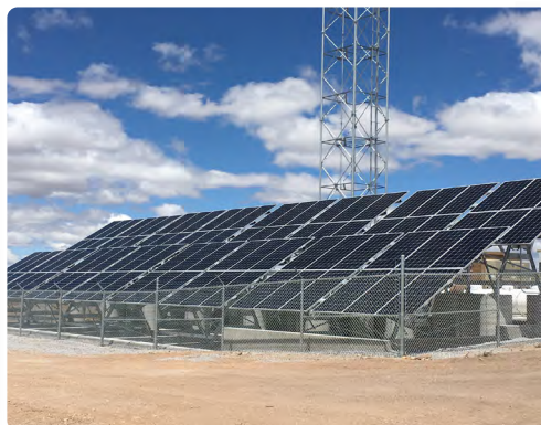
WIRELESS AND COMMUNICATION