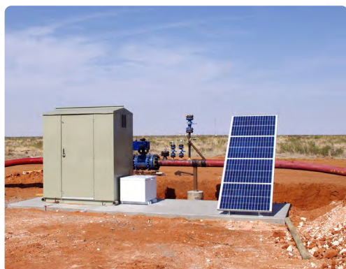
AUTOMATION AND CONTROL