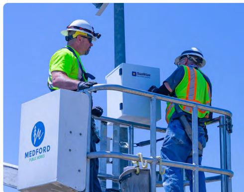
TRANSPORTATION AND LIGHTING