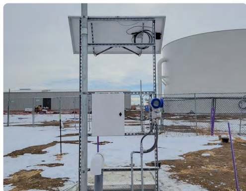
WATER AND WASTEWATER