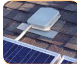
SolaDeck™ PV junction box/string combiner