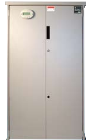
SunWize Solar Ready Battery System components are housed in a gray powder-coated steel, key-lockable enclosure

Depending on the system selected, the AGM sealed batteries provide 13 or 26 kWh (@ 24 hr. rate) of reserve power. Maintenance-free batteries are designed to last 10+ years in float condition. Battery Enclosure Dimensions: 32" W x 58"H x 15"D. Weight with batteries: 920 lbs. Systems GTB072–GTB077 are dual enclosure models. 13 kWh battery expansion box sold separately.