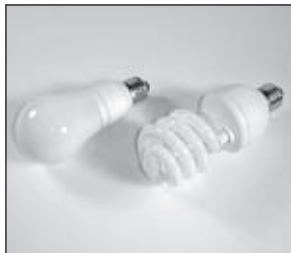
LTB model shown at left, LTS model on right