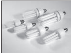
LTM, LTT and LTQ CFL lamps